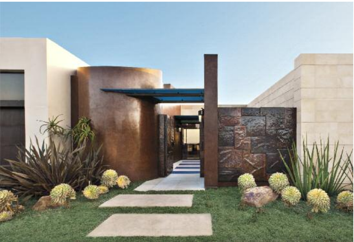
BRONZE METTLE Visitors are welcomed by Elemental Harmony , a large bronze art piece by Los Angeles-based sculptor Malcolm Susman. A variety of drought-resistant succulent plants, added by landscape architect David A. Pedersen of Newport Beach, complement the home's contemporary architecture.