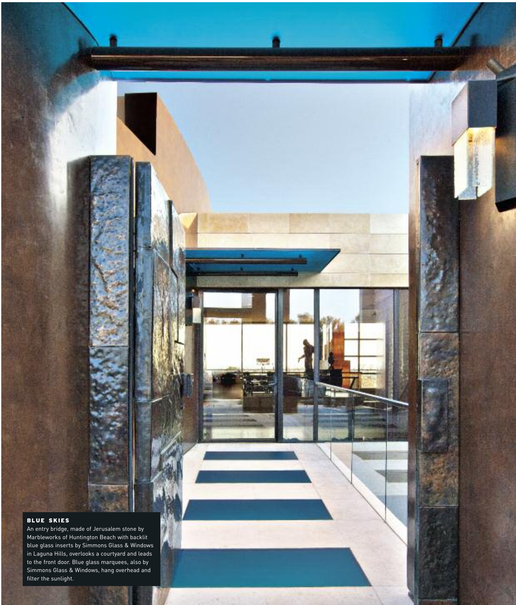
BLUE SKIES An entry bridge, made of Jerusalem stone by Marbleworks of Huntington Beach with backlit blue glass inserts by Simmons Glass & Windows in Laguna Hills, overlooks a courtyard and leads to the front door. Blue glass marquees, also by Simmons Glass & Windows, hang overhead and filter the sunlight.