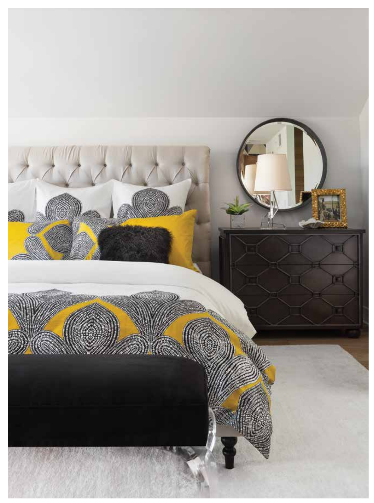
Curves and angles abound in the swirling designs that define the bedclothes, angular woodwork that details the dresser, and Lucite legs that add a novel quality to the bench.